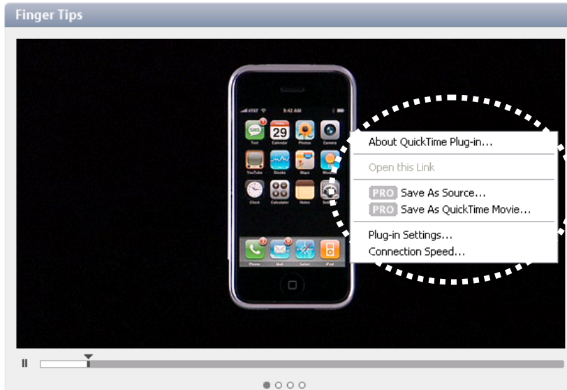
Apple QuickTime Movie

For example, QuickTime and Flash movies are below. These ones are difficult to save as a picture but capturing a screen snapshot would be a way to go! Please see the screen snapshot help sheet.