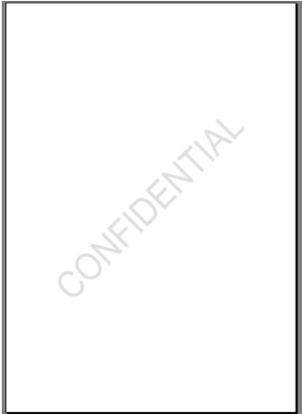
Watermark Sample [CONFIDENTIAL]

A Watermark is a pale image or text that is displayed behind text in a document, either diagonally or horizontally. The watermark displays important information that won't be missed by the reader such as "Confidential" and "Draft".