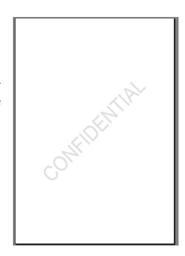
Watermark Sample [CONFIDENTIAL]